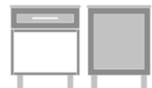
TENS10 21W 19D 25H