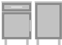
TEBS11L 21W 19D 30H