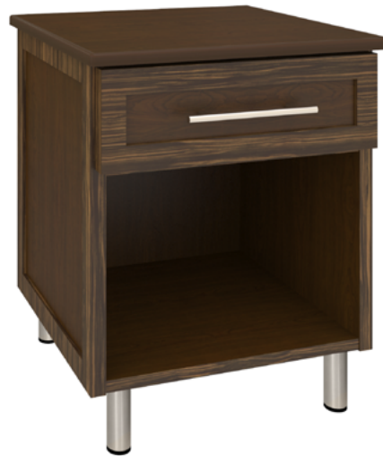
Model: TENS10 21W 19D 25H

Contemporary Tempe Collection is stunning storage featuring dual-tone finishes and an overlay door and drawer design. The premium, oversized, steel hardware offers contemporary styling and easy-to-grab functionality and the dual-tones make this collection perfect for memory care giving the resident a visual boost.