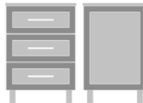
TEBS30 21W 19D 30H